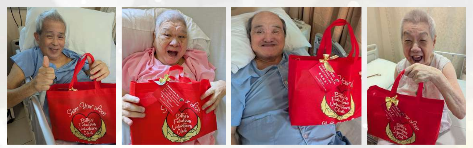
Christmas goody bags for residents from Betty's Fabulous Volunteers group