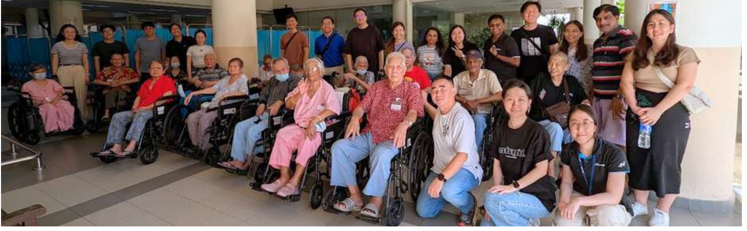
Coffeeshop Outing with volunteers from Rotary Club of Singapore West and Micron Singapore