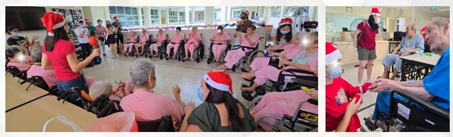
Christmas Carolers from Hope International Ministries (HIM)