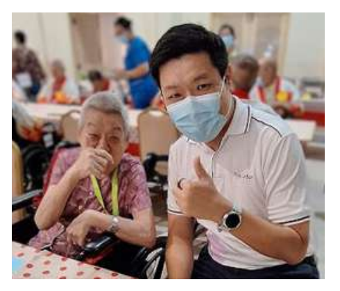
Family Day 2024