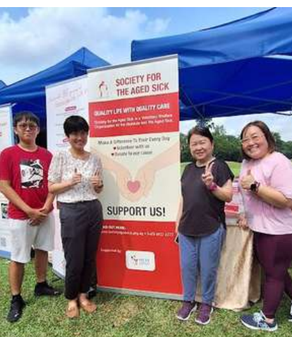
Keppel Club's Charity Golf tournament in September 2024