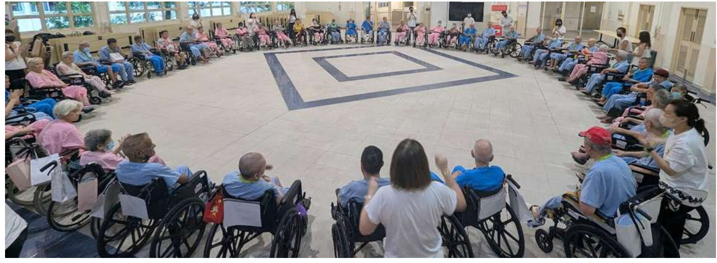
National Day celebrations with Aljunied GRC and multiple groups, as well as stunning performances by Wind Ensemble