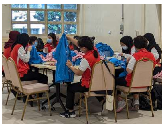
PCF group engaging with residents and helping to mend clothes