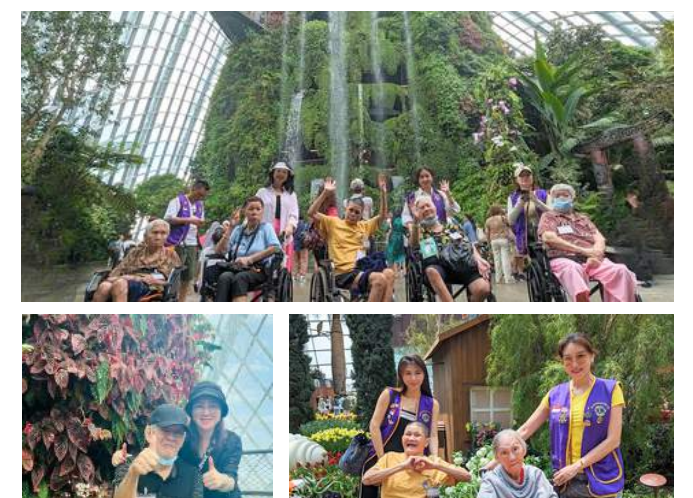
Thank you to Lions Club Singapore Cherish for sponsoring and helping to bring our residents around the gardens!

Our residents really enjoyed having a day out, seeing the brightly coloured flowers and the waterfall features. Hopefully, with the help of more volunteers and sponsors, we will be able to bring them to experience more outdoor ventures!