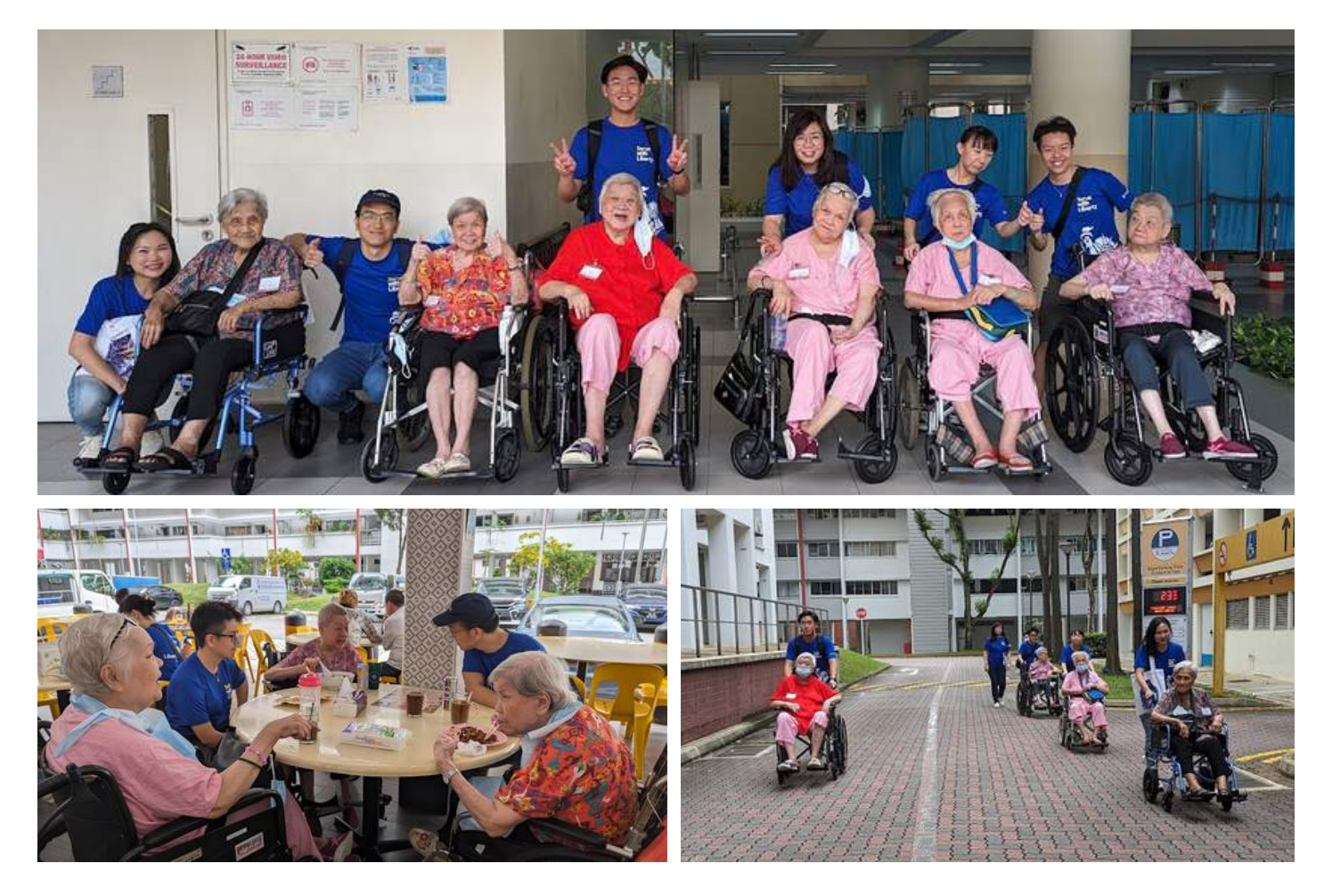
Coffeeshop Outing with volunteers from Liberty Insuarance