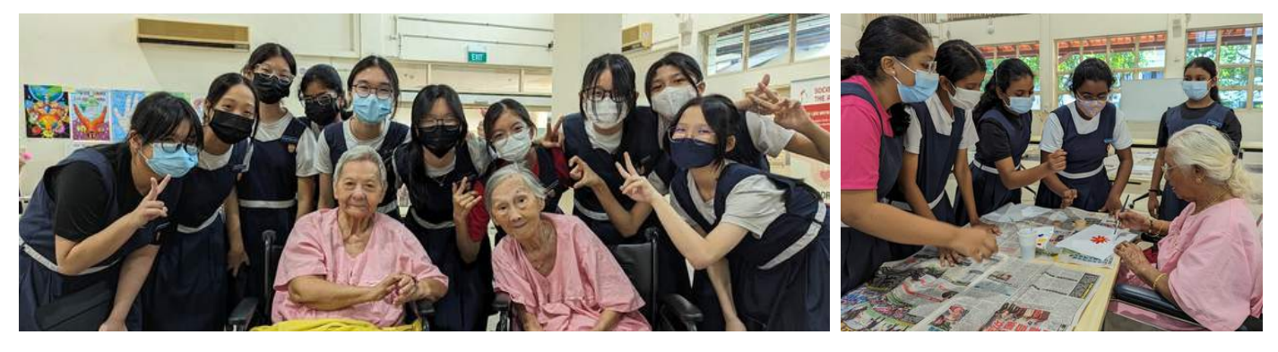
Student Volunteers from PLMGSS