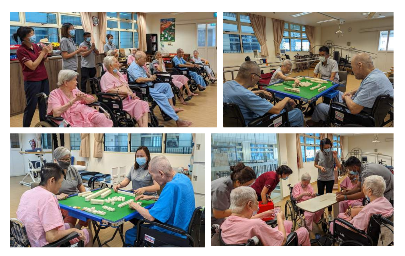
Monthly volunteers from Woh Hup Group